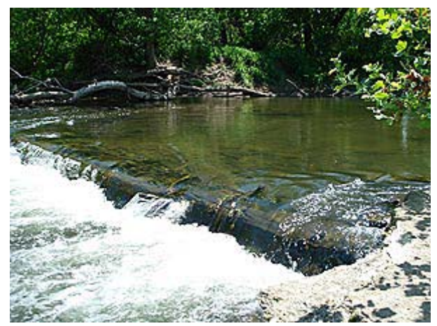
Removal of Dam No. 1 will facilitate fish passage four miles farther upstream.