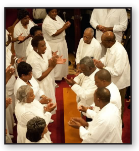
Singing and Praying Band of Maryland & Delaware