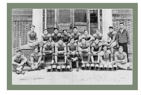
CAESAR RODNEY HIGH SCHOOL FOOTBALL TEAM

Football teams from the "Annual Thanksgiving Day Football Game, 1937" Dover High School vs. Caesar Rodney High School.