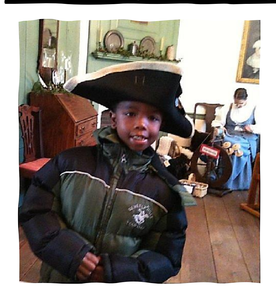
They Learn by Doing!