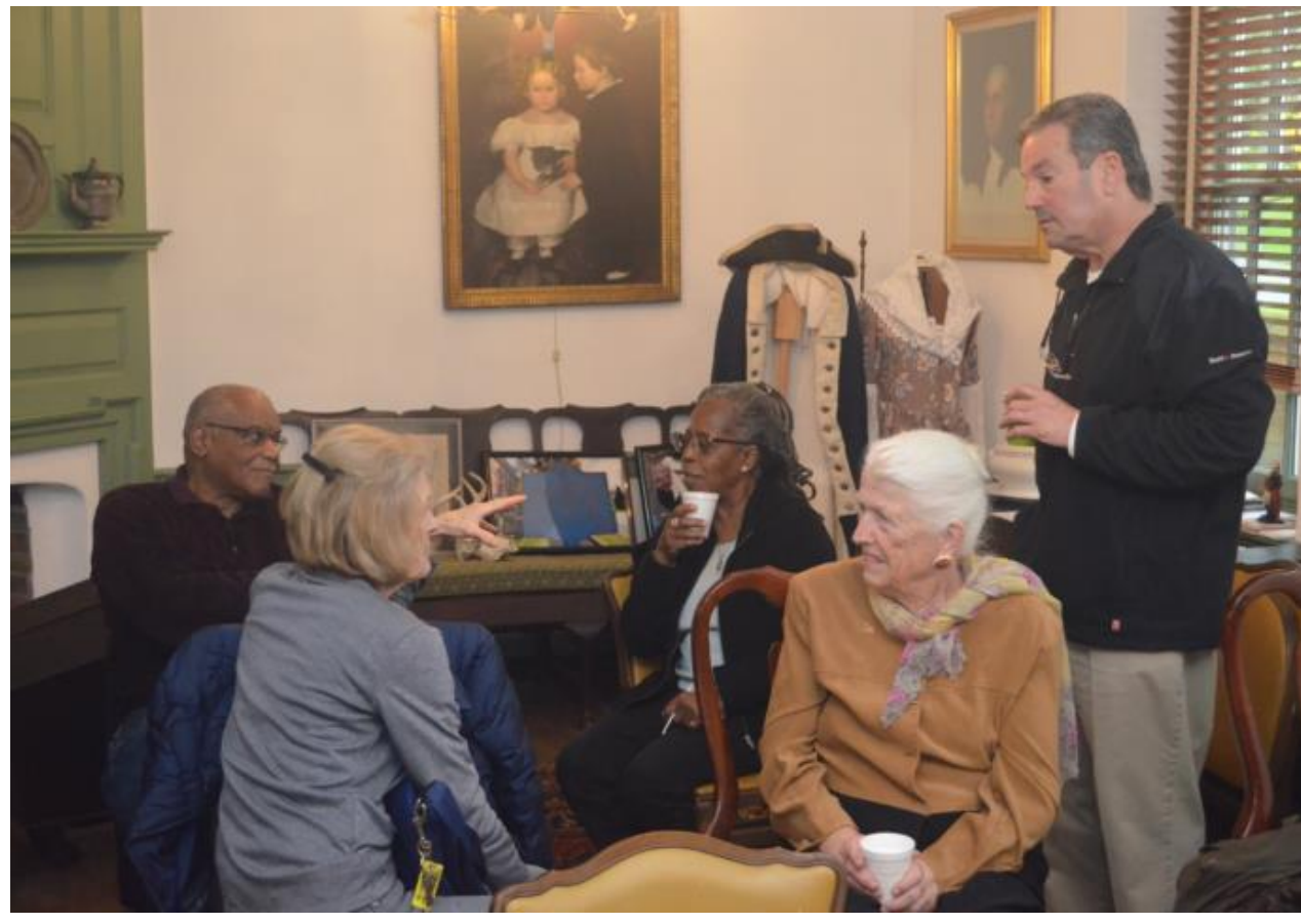
Party On, Dudes!